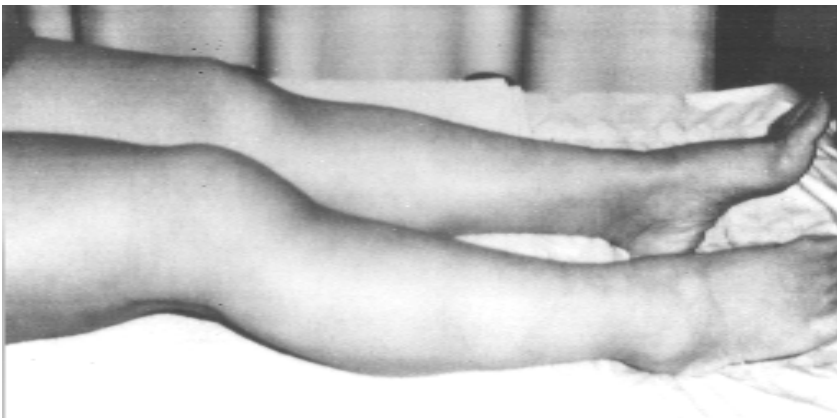
Figure 2. Post-treatment: The edema disappeared.